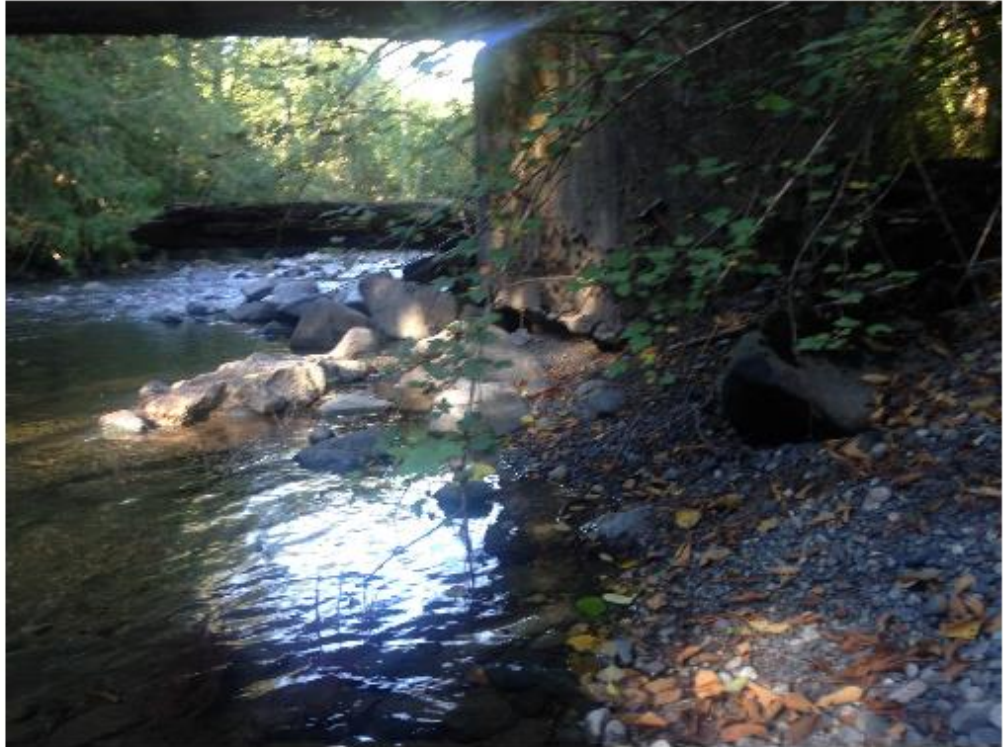
3.) Looking downstream at center pier