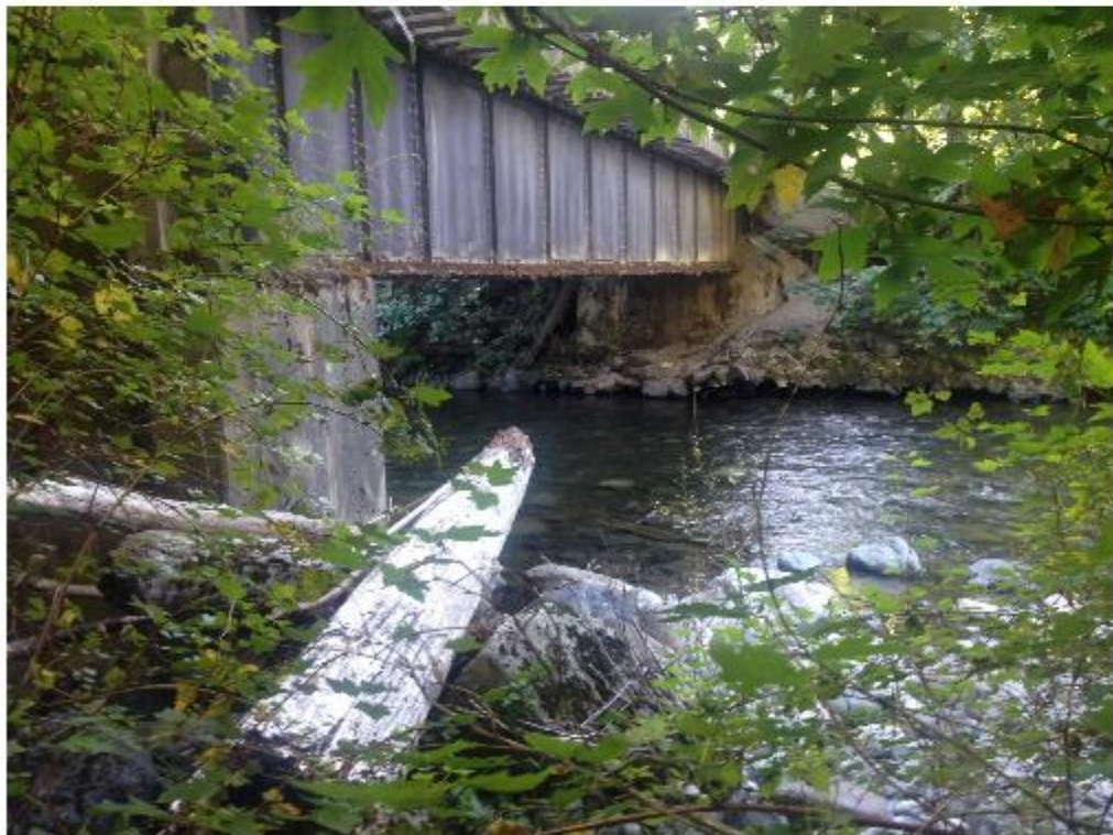
2.) Looking downstream at river right abutment