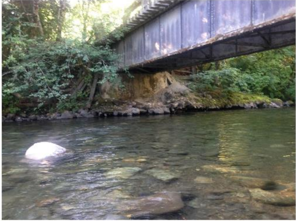
1.) Looking upstream at river right abutment