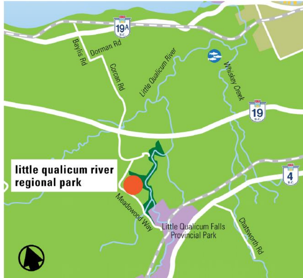
Figure 1: Overview Map