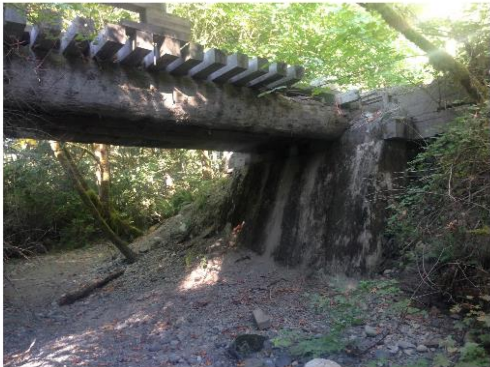
4.) Existing wood stringers to be removed