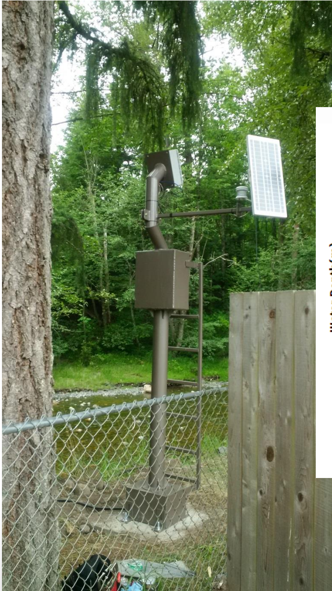
Haslam Creek Water Level from: May 16, 2016 12:20 PM to Jul 07, 2016 08:00 AM