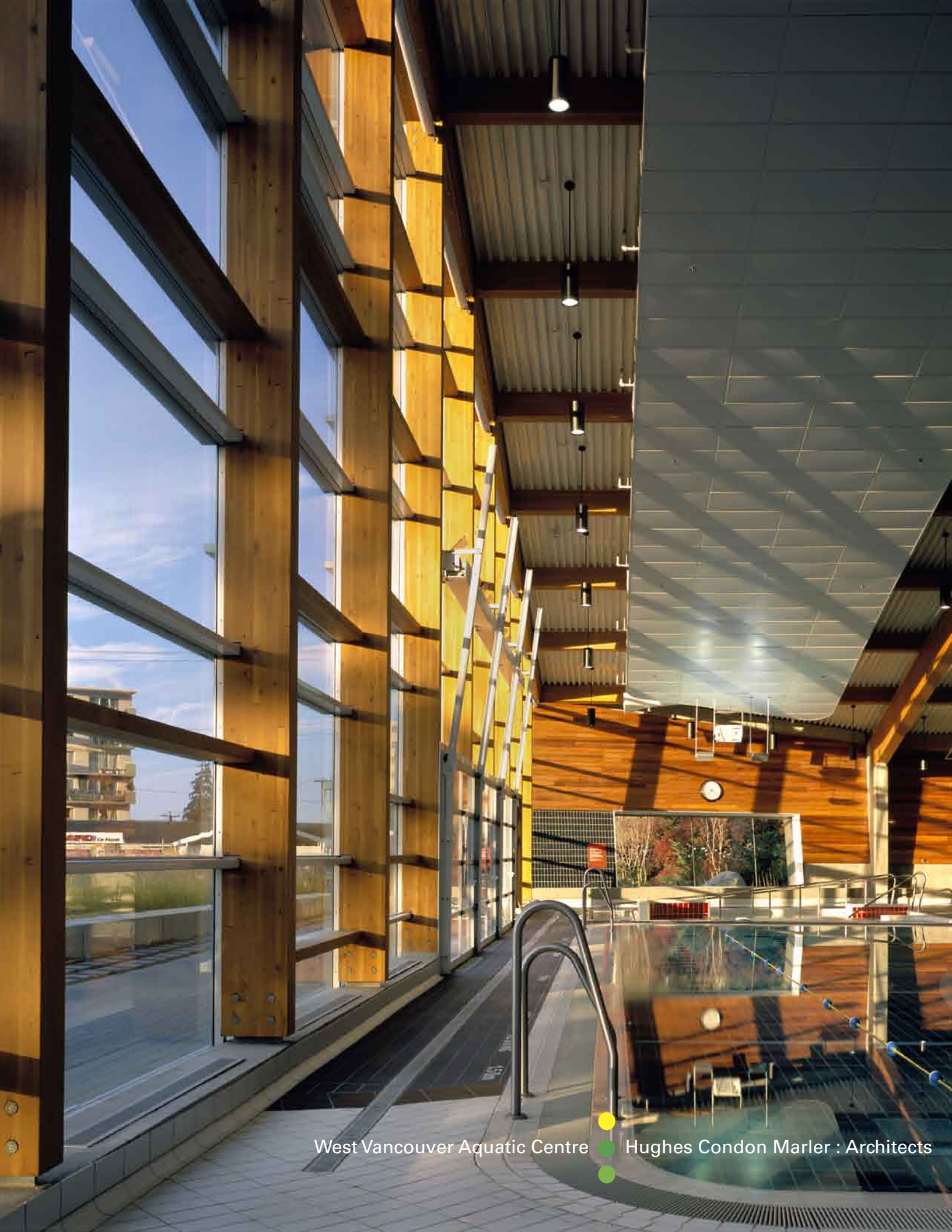
West Vancouver Aquatic Centre